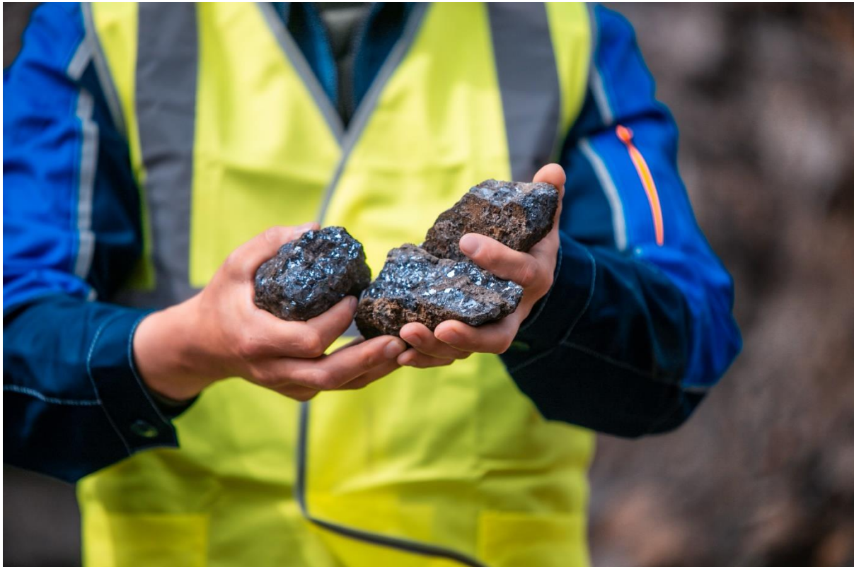
Mangazeisky Silver Project – Open Pit